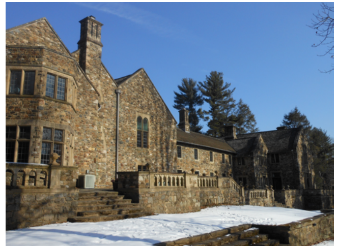
Photo of the Mansion