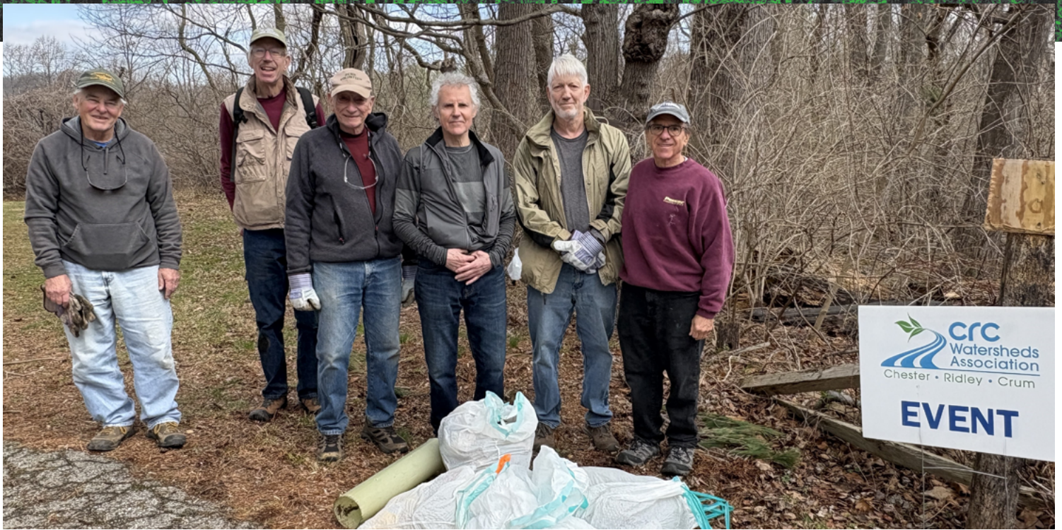
Volunteers at the 2026 CRC Streams Clean-up