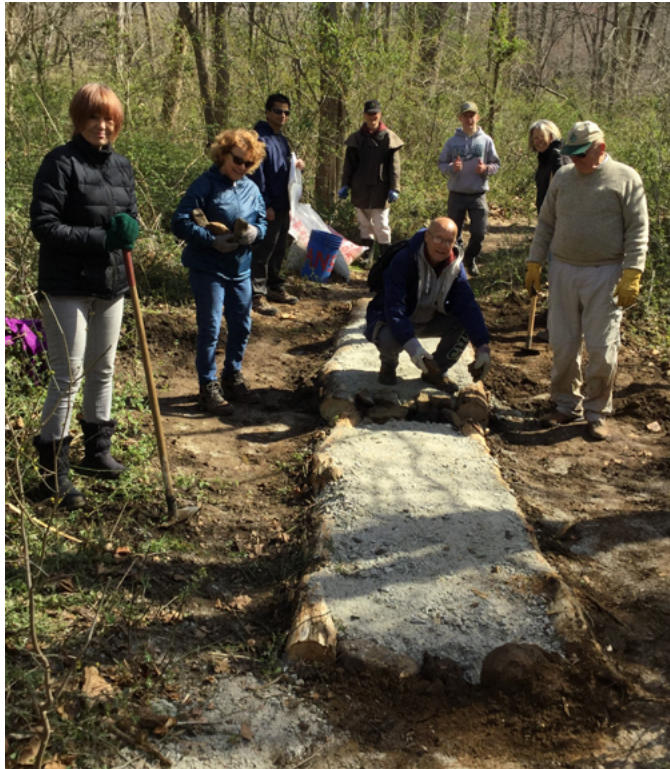
Volunteers construct a turnpike on the yellow trail in April 2022