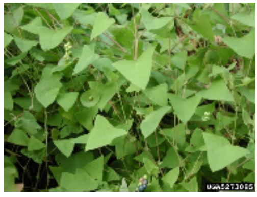
mile-a-minute weed This work is licensed under a Creative Commons Attribution-Noncommercial 3.0 United States License.

You may be familiar with mile-a-minute weed ( Persicaria perfoliata ), hereafter referred to as MAM, both in the park and possibly in your own yard. We know that it is an aggressive, fast-growing annual vine that will cover any surrounding vegetation. Since MAM's inadvertent introduction from Asia to North America (starting in York County, Pa.), it has spread up and down the East Coast and as far west as Ohio. Other than using herbicides or mechanical techniques, which have their own drawbacks, this noxious vine has been difficult to manage.