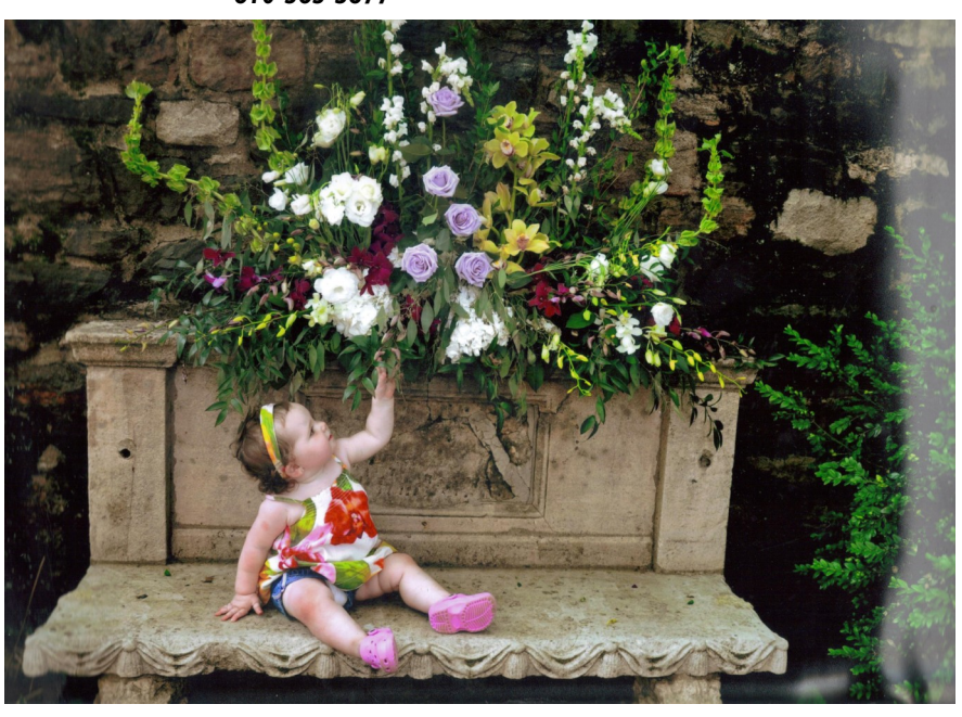
2009 Winning