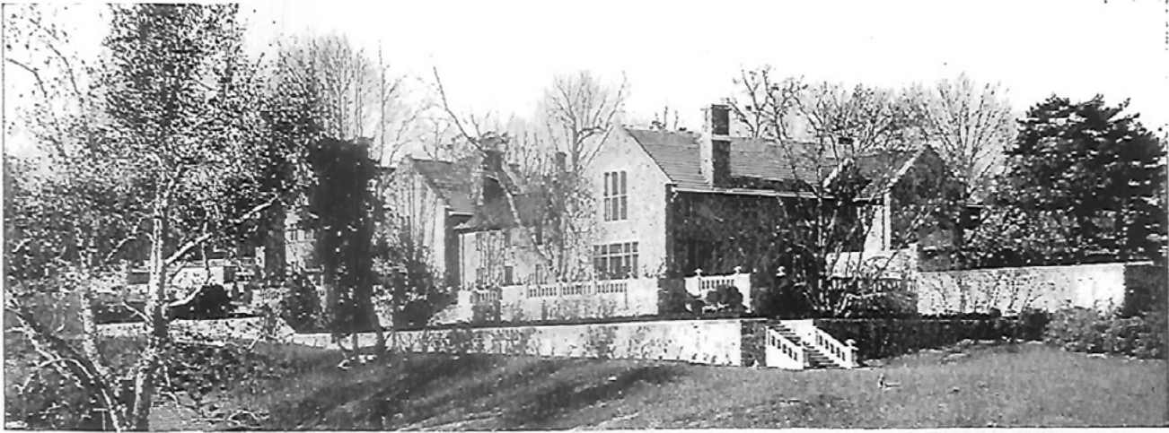
WILSON EYRE & McILVAINE, Architects

A photo of the Mansion from a 1921 magazine "American Homes of Today."