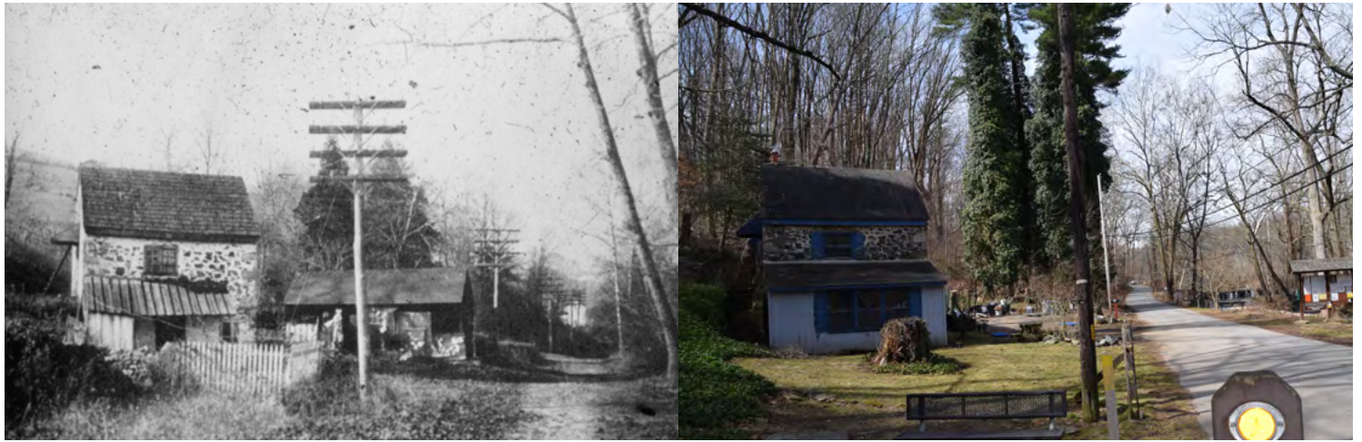
Sycamore Mills Rd Entrance - Then and now.