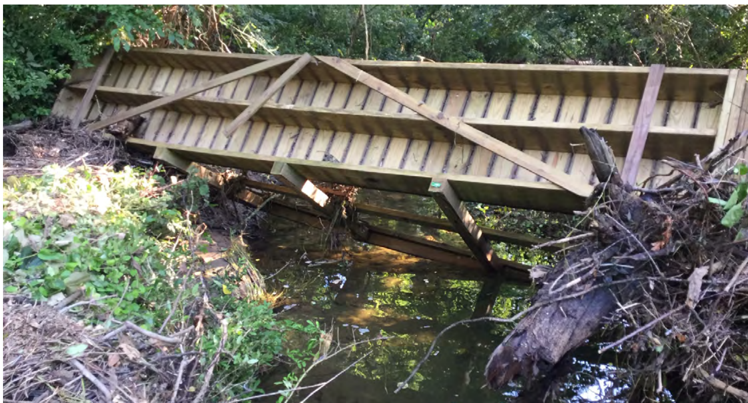
Footbridge behind the mansion relocated by flooding