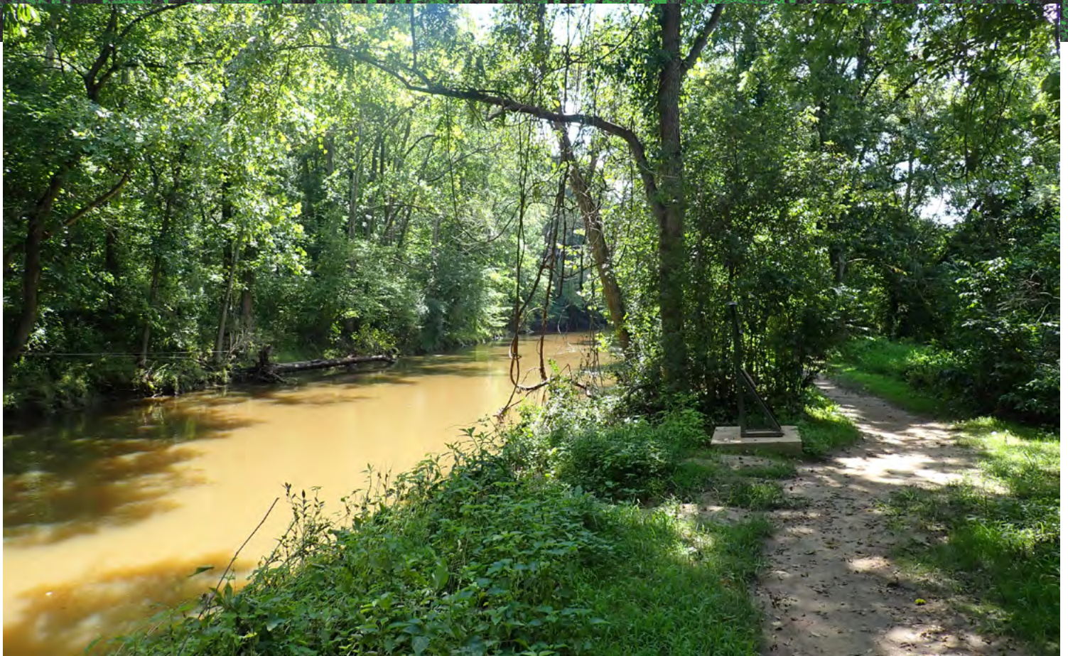
Walking trail in White Clay Creek Preserve