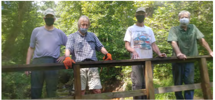
Trail work continued

We all agreed that the installation was temporary but is important to have this section of the trail passable once more so our hikers can keep their Adidas dry. We also needed to demonstrate that we could operate under the official approved COVID-19 mitigation plan or discover any problems with the plan. This project was another step toward the eventual reopening of our first Saturday work days.