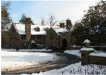
Join the Friends - visit the park!

Did you ever wonder how this newsletter gets printed, or who arranges the Holiday Party and other events? Well it's the volunteer Board of the Friends of Ridley Creek State Park! The board relies on membership dues and donations to help fund these functions. Without you, our Friends, and your dues, there is no way we can help enhance the park and hold the fabulous functions like